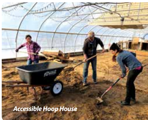
Accessible Hoop House