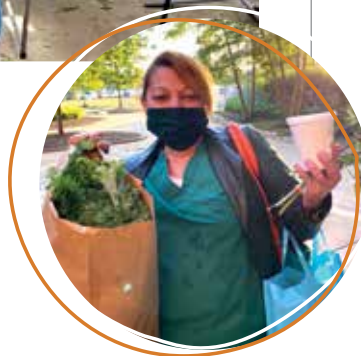
Right: Health care staff picking up farm produce and flowers during change of shift.