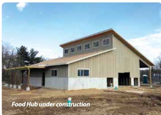
Food Hub under construction