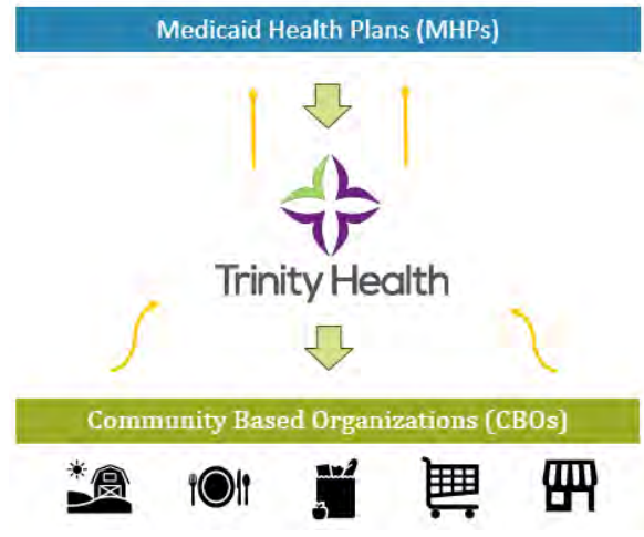
Image: network design for Trinity Health cooperative network